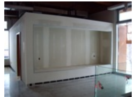
An example of a CASA showcase window

As is the case with most TSDG displays, insurance is the responsibility of the artist for pieces included in either show. A completed "Call for Entry" form must accompany all work submitted. Artwork chosen to be included in TSDG shows will be selected so as to create a cohesive display within the available space which shows each artwork to its best advantage.