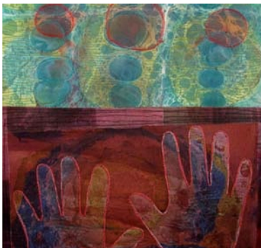
For more information about Lisa Grey, please visit lisagrey.com

The Art of Looking Sideways: Connecting Creativity and Play