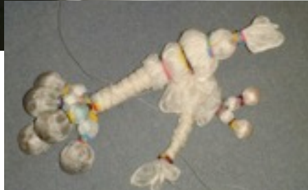
Above and to right, Dana's creatures bound up and ready to dye.