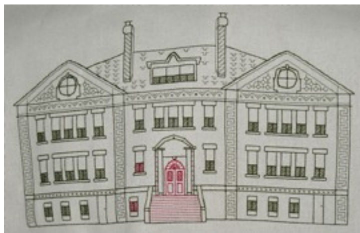
Galbraith School stitched in blackwork, designed and stitched by Belinda Crowson