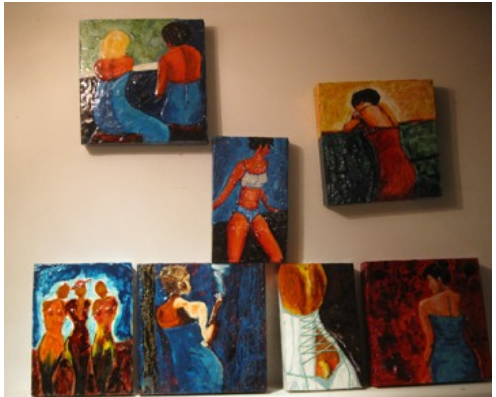
Above: Collection of miniatures by Mireille Cloutier