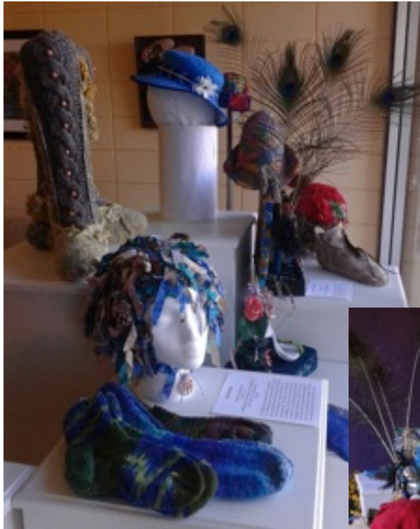
Top to Toe Challenge - above and to right