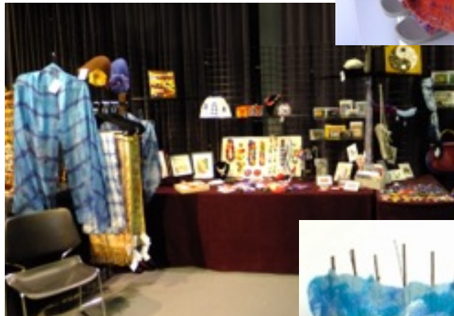
TSDG at the Artisan Market

The TSDG presented the Top to Toe Challenge display at the Allied Arts Council office. The Guild also participated in the Artisan Market at CASA in the ATB Financial Community Room. Some guild members also had work in the Galt Museum 8th Annual 3 Dimensional Sculpture Show.