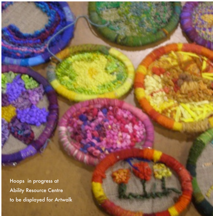
Hoops in progress at Ability Resource Centre to be displayed for Artwalk