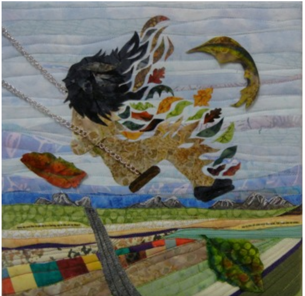
Blown Away, Tweela Houtekamer, mixed media