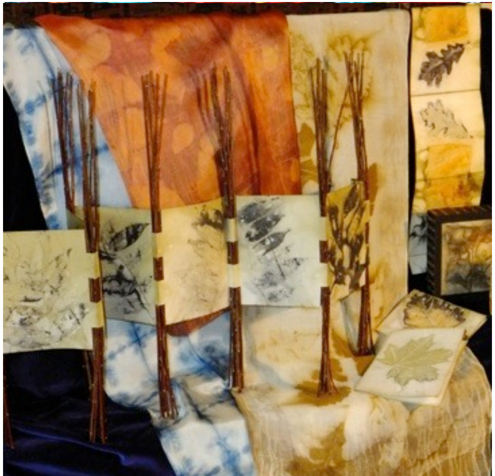
A few examples of member work which will be for sale at the Spring Sale.