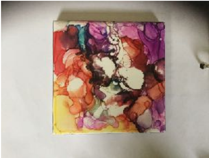
Example of alcohol ink on a tile by Mireille Cloutier

Also bring your " Show & Share " examples & projects from January & February.