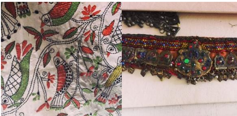
Some textiles admired at our field trip to Dirk's house in Calgary.