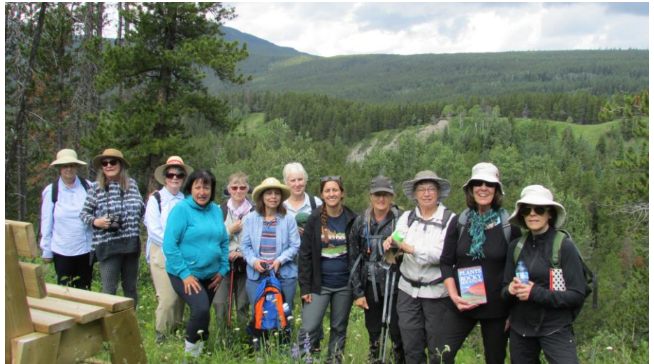
Members during our hike at Castle Provincial Park